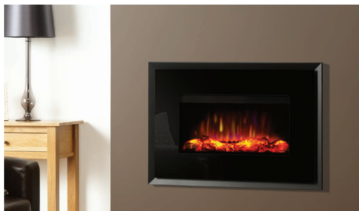
Invoke Black Glass Fascia