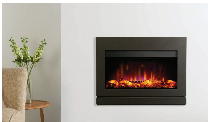
Designio2 Steel Fascia - Graphite