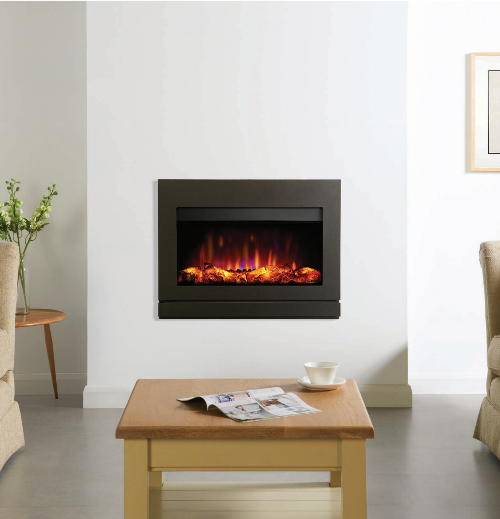
Riva2 670 Electric Designio2 Steel Fascia - Graphite