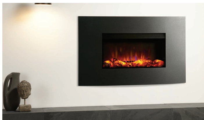
Verve XS Fascia - Graphite