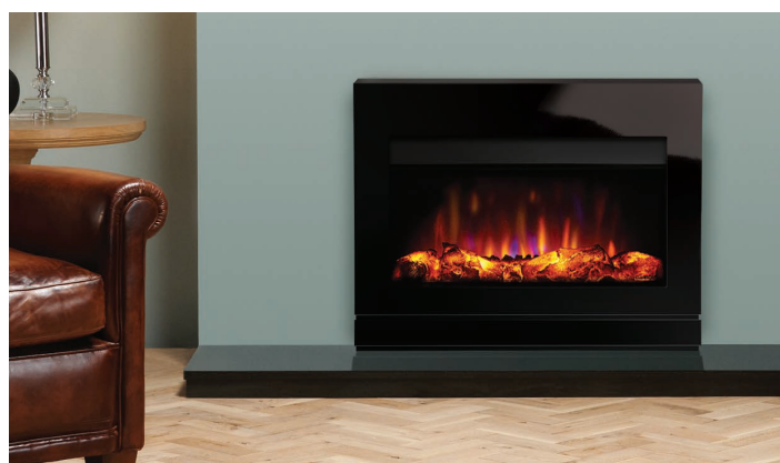
Designio2 Black Glass Fascia