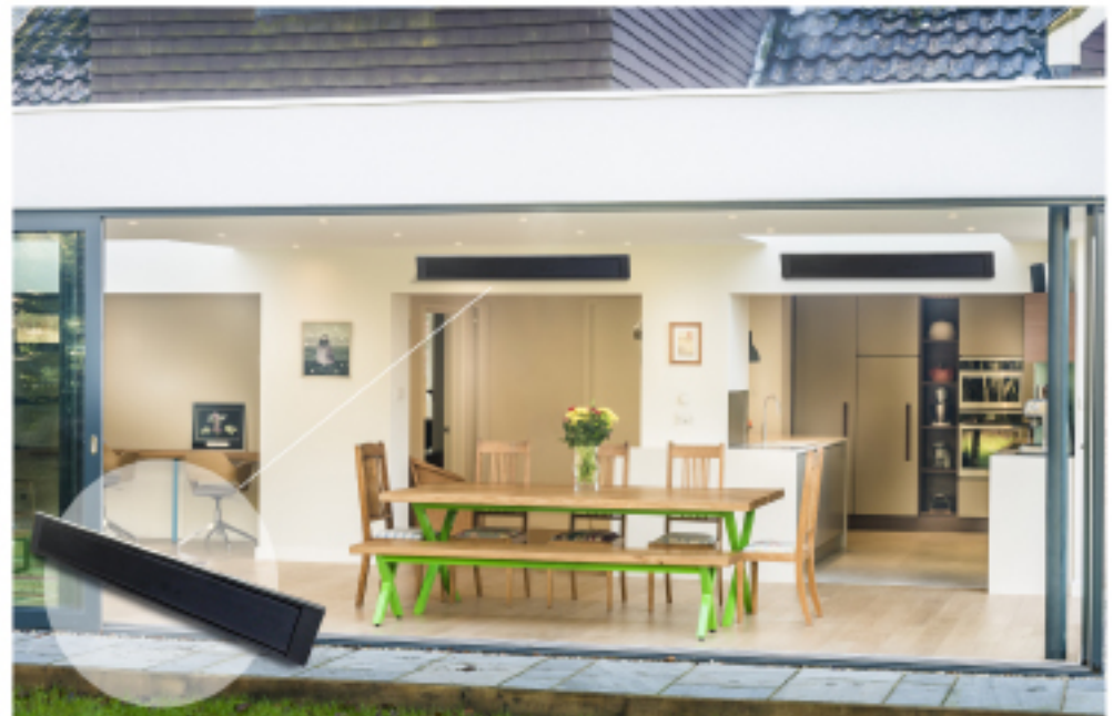
Above Comfortline Terrace Heater Front and back cover are Comfortline Excel in black & white