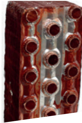
WITHOUT BLYGOLD POLUAL XT